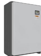
ELV 1 SERIES